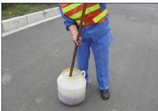
Step 3 (a)

2. Draw the outline lines of marking tape and sign pattern on the road surface which need sticking the marking tape and sign.