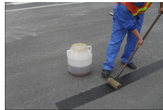
Step 3 (b)