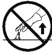
Step 3 (C)