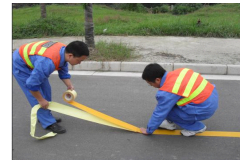
Step 3 (d)

3. Open the cover of adhesive, which is equably roiled, the hair roller or brush of resisting solvent is used, thickness moderate adhesive is equably brushed inside ground outline line and marking tape surface, The ground surface must be brushed twice, put certain time to air after being first brushed, brushed second time when the sticky glue is not moved on the skin with hand, it must have certain strength as the ground surface being glued, so as to ensure the glue layer on the ground being fully soaked. Especially the glue in the corner place of the sign pattern must be brushed. It can be pasted when the ground glue and marking glue are taken in second time and half-dried in shape and do not move to the skin. If the air time is too long and the glue liquid has been completely dry, it can also brush again until it does not move paste on the skin.