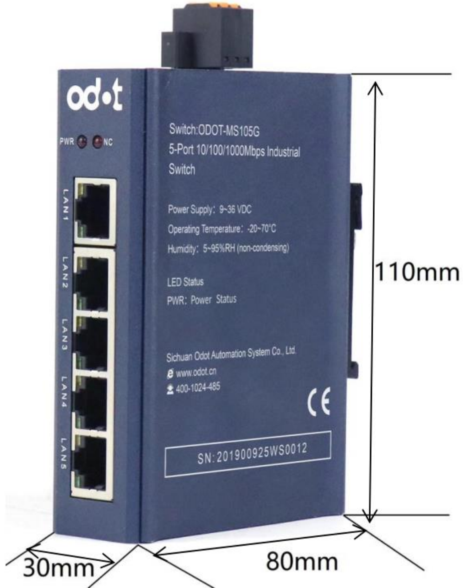
Table 2.4.1 ODOT-MS105G Installation Size