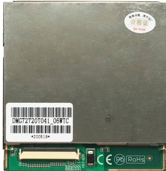
硬件接口图 Hardware interface