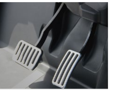
ACCELERATOR / BRAKE

PEDAL The accelerator is on the right. The