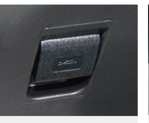
TRUNK UNLOCK LATCH

Standard with three-point safety belts in the front seats and two-point safety belts in the rear seats.